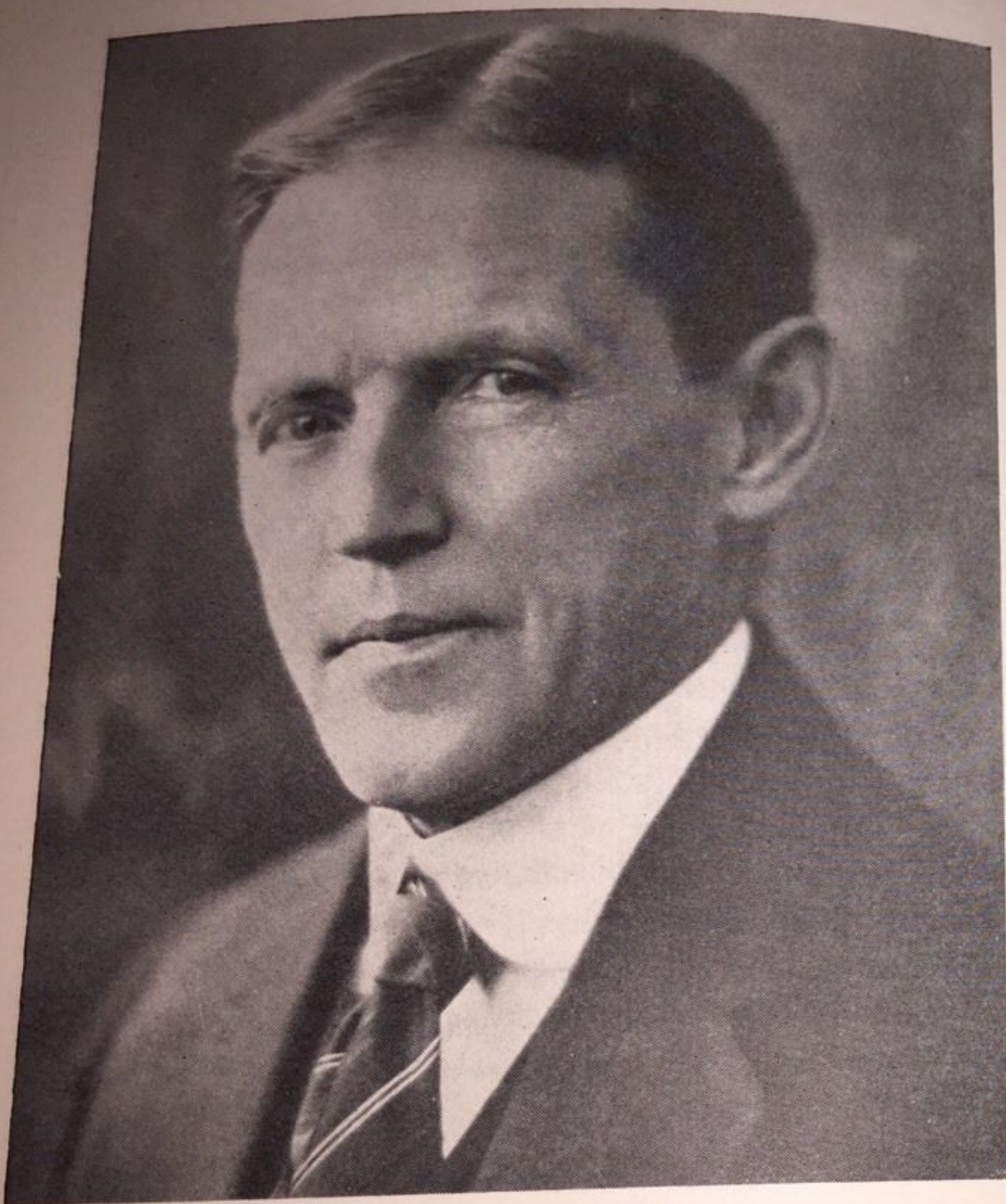
WILLIAM H. BATES, M.D.

Ophthalmologist and Discoverer of the Cure of Imperfect Sight by Treatment Without Glasses